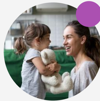
Caregivers and Organizations that support them