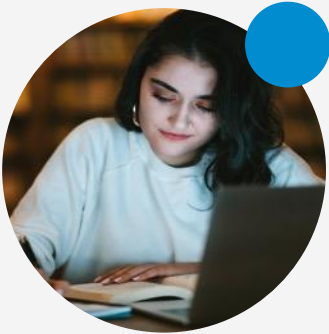
Transition-Age Foster, kinship and probation youth (age 16-26)